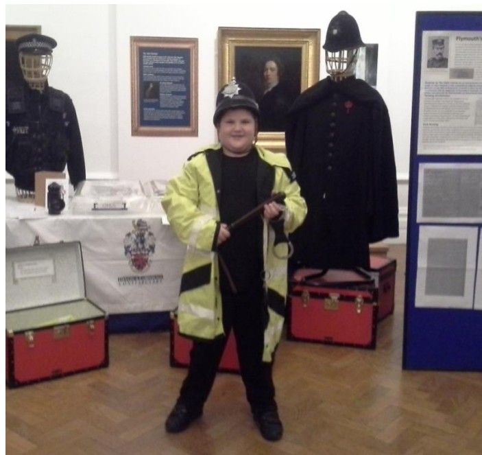
A potential police recruit enjoying his visit to the exhibition