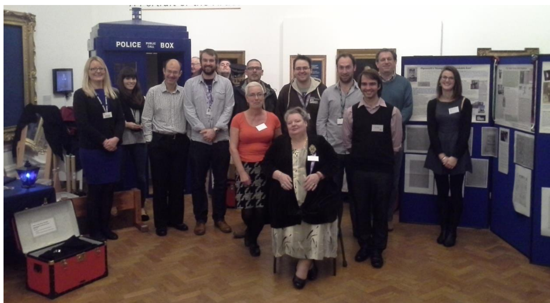
Some of the many participants involved in the day's events